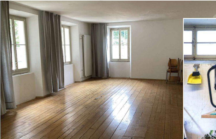
One of many workspaces