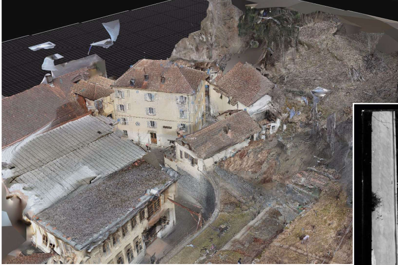
Digital representation of the Cima Città with the residency houses in the back and the garden in the foreground