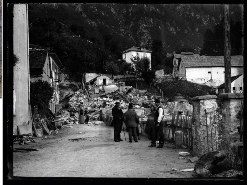
Flooding of the Soia and destruction of parts of Cima Norma in 1908