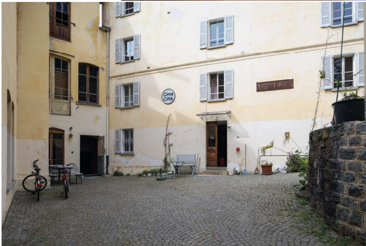
Courtyard and two of a total of seven bedrooms