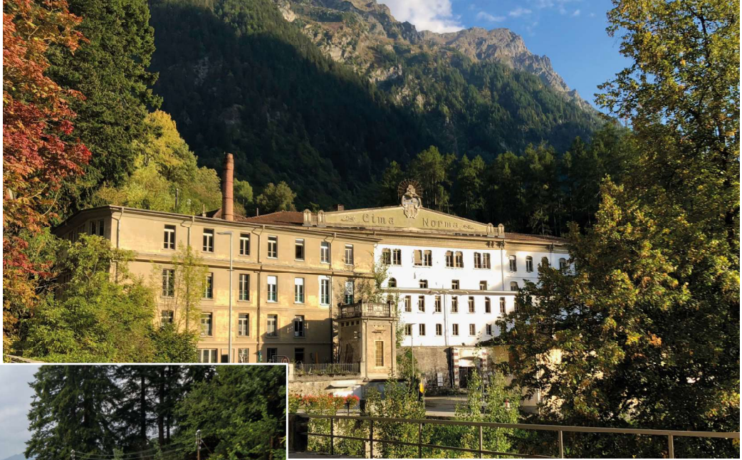
View of the factory from Dangio