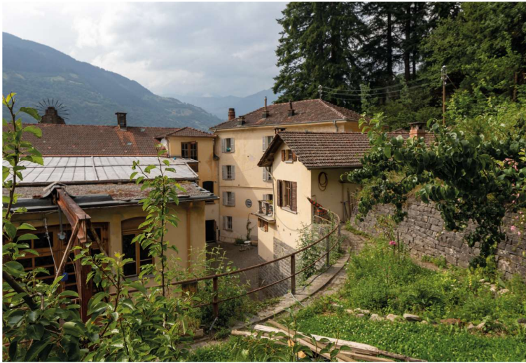
Cima Città is surrounded by mountains, forests and rivers