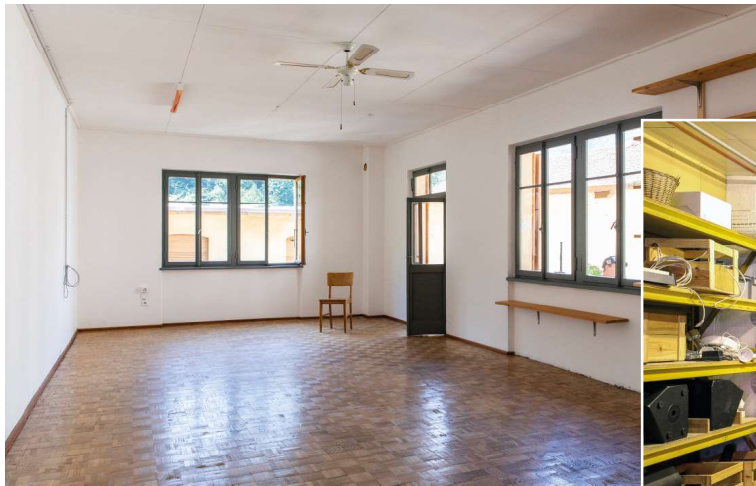
Work and dance room "Giorgio"